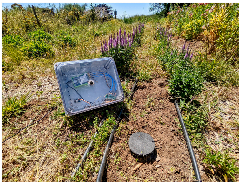
Fig. 1. Soil microbial fuel cell staged for deployment at the University of California, Santa Cruz Center for Agroecology.

remediation of heavy metals in soil (Sun et al., 2022; Li et al., 2022). Concern for heavy metal contamination will only continue to grow alongside anthropogenic activities such as agriculture, mining, and industrial processes (Nguyen and Huynh, 2023; Mironova et al., 2022). These activities are known to result in heavy metals leaching into soil and water (Ene et al., 2009), eventually becoming hazardous to human health as they are incorporated into crops, livestock, and wildlife (Alengebawy et al., 2021). Despite the significant impact SMFCs could have as in situ heavy metal remediators, studies to date have been limited to laboratory contexts. Progression to preliminary field studies is urgently needed.